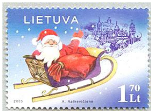
Here comes Santa Clause Right down Santa Clause Lane

Last month we celebrated the holidays with some refreshments and a sing-a-long program. There were lots of candies, cookies, etc. Thanks to everyone who brought something. Our chorus was not up to speed though. I think we are going to need some practice for next year.