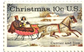
Dashing through the snow in a one-horse open sleigh Jingle Bells Jingle bells