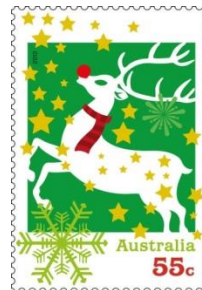
Rudolph the Red-Nosed Reindeer had a very shiny nose