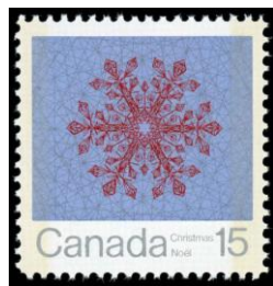
Let it Snow Let it Snow Let it Snow